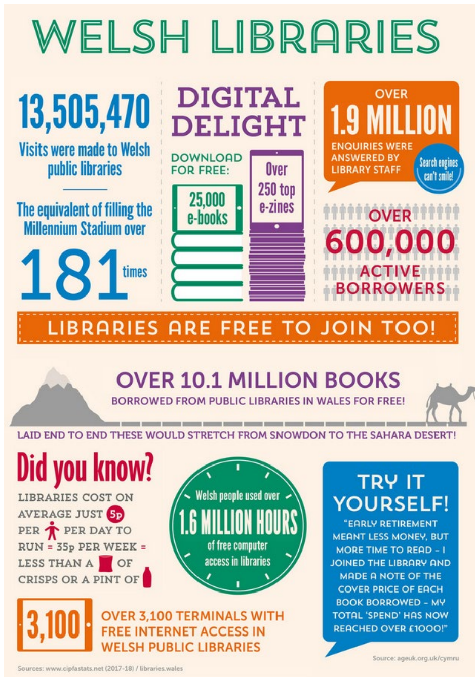
Example 3: Infographic